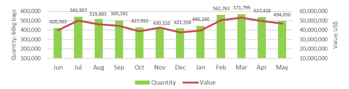
Table1: Comparison of Coffee Exports of May 2019/20 and 2020/21 Coffee Years